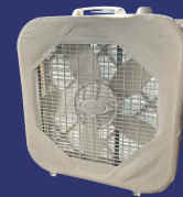
Your DIY Air Cleaner